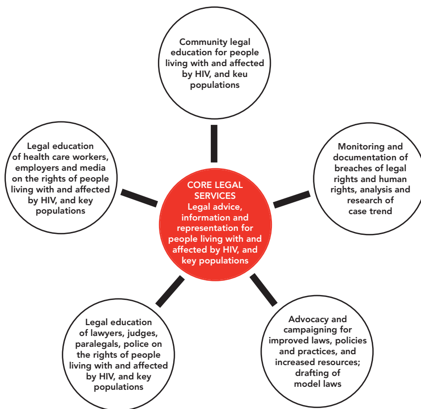
Figure 1 WHAT ARE HIV-RELATED LEGAL SERVICES?

Figure 1 presents a model of legal services. The circle in the middle represents the core activities that HIV legal services comprise. These activities ensure that people living with HIV, people affected by HIV and key populations can claim and enforce their legal rights. The outer circles represent additional activities, such as education, law reform, advocacy and research, that will help to create legal and human rights literacy, generate demand for legal services, ensure that legal services reach the most marginalized and provide an enabling environment for HIV prevention, treatment, care and support programmes.