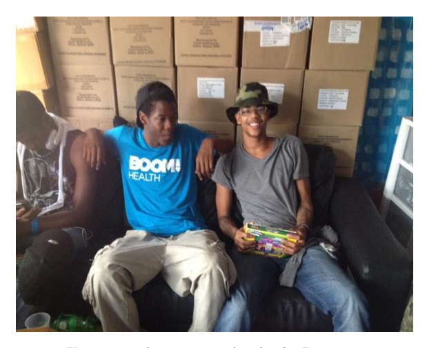
Young men's group session in the Bronx

The Go Girl! Advocates , as they dubbed themselves, are receiving advocacy skills training and will have the opportunity to share their stories and the stories of their peers involved with ACS.