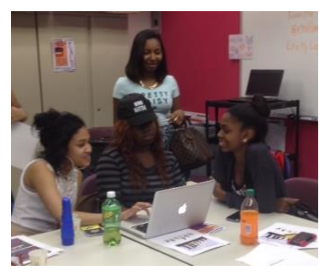
Go Girl! Advocates session in the Bronx

Participants in BOOM!Health's young men's group joined our Youth Advocacy Corps in June 2014. The young men are participating in sexual health advocacy programming similar to that of the Go Girl! Advocates, but with an emphasis on the rights and needs of LGBTQ youth, particularly young gay, bisexual, and trans men of color.