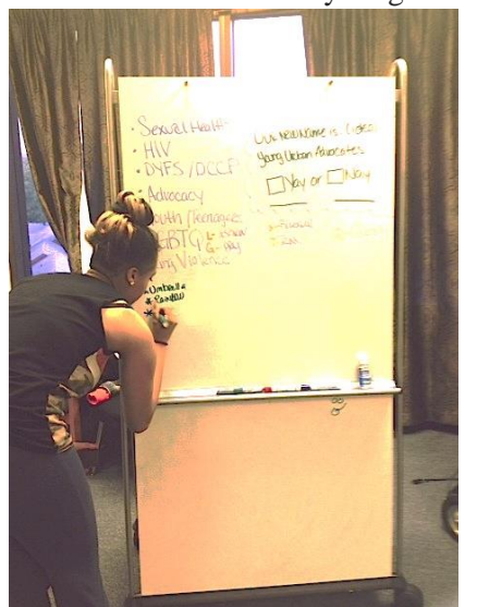
Young Urban Advocates session in East Orange, NJ, June 2014

recreational activities for young men and women ages 13 to 18.