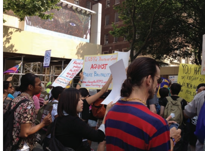
Members of FIERCE march in Silent March to End Stop and Frisk, New York City, June 2012