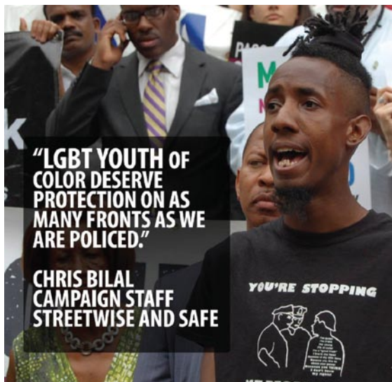
Streetwise and Safe (SAS) campaign staff speak out at Communities United for Police reform rally in support of Community Safety Act, New York City, July 2013

At other times, our experiences are marked by homophobia and transphobia in addition to racism and policing of poverty. This past December, my friends and I were stopped, questioned, and searched in Marcus Garvey Park in Harlem—not on the pretense that we had weapons or contraband—but because we were three Black gay men in a park. The fact that we were dancing to Beyoncé was presumably enough to give rise to reasonable suspicion that we were engaged in unlawful sexual activity.