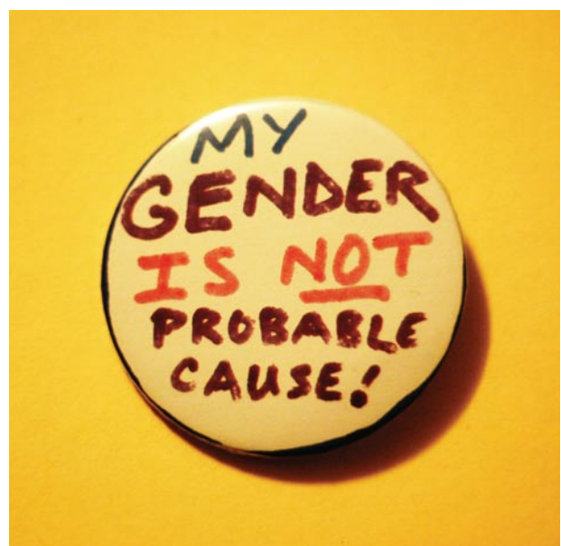
“Know Your Rights” buttons created by LGBT youth leaders at Streetwise and Safe (SAS)