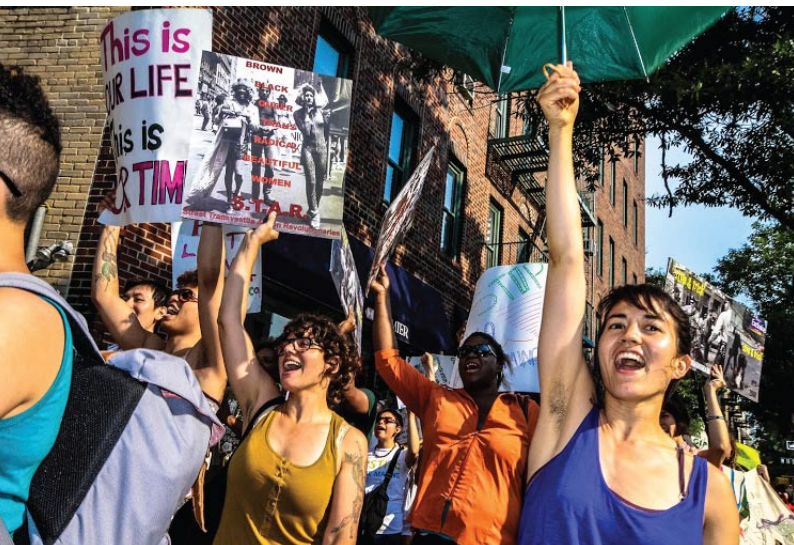
Trans Day of Action, organized annually by the Audre Lorde Project, New York City, June 2012

[A]n attorney from the South represented a male-to-female (MTF) transgender youth who was detained in a boys' facility. The youth's "treatment plan" stated that she was to receive "help with gender confusion and appropriate gender identity," which included staff prohibiting her from growing her hair out or having any feminine accessories. The same attorney reported that another client—a gender non-conforming lesbian—had a similar treatment plan "even though she fully accept[ed] that she [wa]s a female, fe[lt] that she [wa]s a female, and seemed to have no confusion about her gender." In another case, a mental health evaluator encouraged the court and facility staff to help a transgender youth, who had been diagnosed with GID, to understand that it was not appropriate to "act like a girl" while incarcerated in a boy's facility.