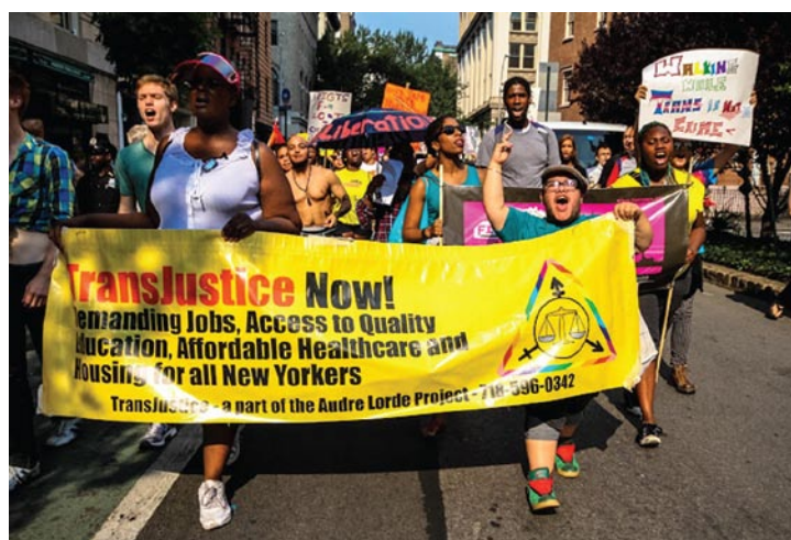
Trans Day of Action, organized annually by the Audre Lorde Project, New York City, June 2012

I have represented many clients in cases where their food stamp or Medicaid benefits are being cut because they are accused of breaking the rules of the program. I have heard the same story many times. Usually a client finds me after they have been to a meeting with an investigator, in which they were bullied and intimidated into signing something. Sometimes they are threatened with jail if they don't sign or are vaguely told something worse will happen if they don't sign. Sometimes they are individuals who do not understand English who were not provided with an interpreter. Almost always they don't know what they've signed. Most often, it turns out they have unknowingly signed a pre-written statement that they have intentionally lied or concealed information in order to receive benefits for which they knew they weren't eligible. The result is that they receive a penalty of at least one year without benefits and now while living in poverty must pay back the benefits they allegedly fraudulently received. When it is about Medicaid benefits, they are forced to pay back thousands or tens of thousands of dollars in medical costs.