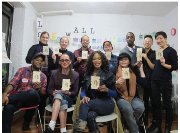
Community Members gather at the Sylvia Rivera Law Project to write postcards to prisoners.

“As a black trans woman, I experienced sexual violence while in prison. I was put in blatantly dangerous housing situations where officials knew I would be taken advantage of.”