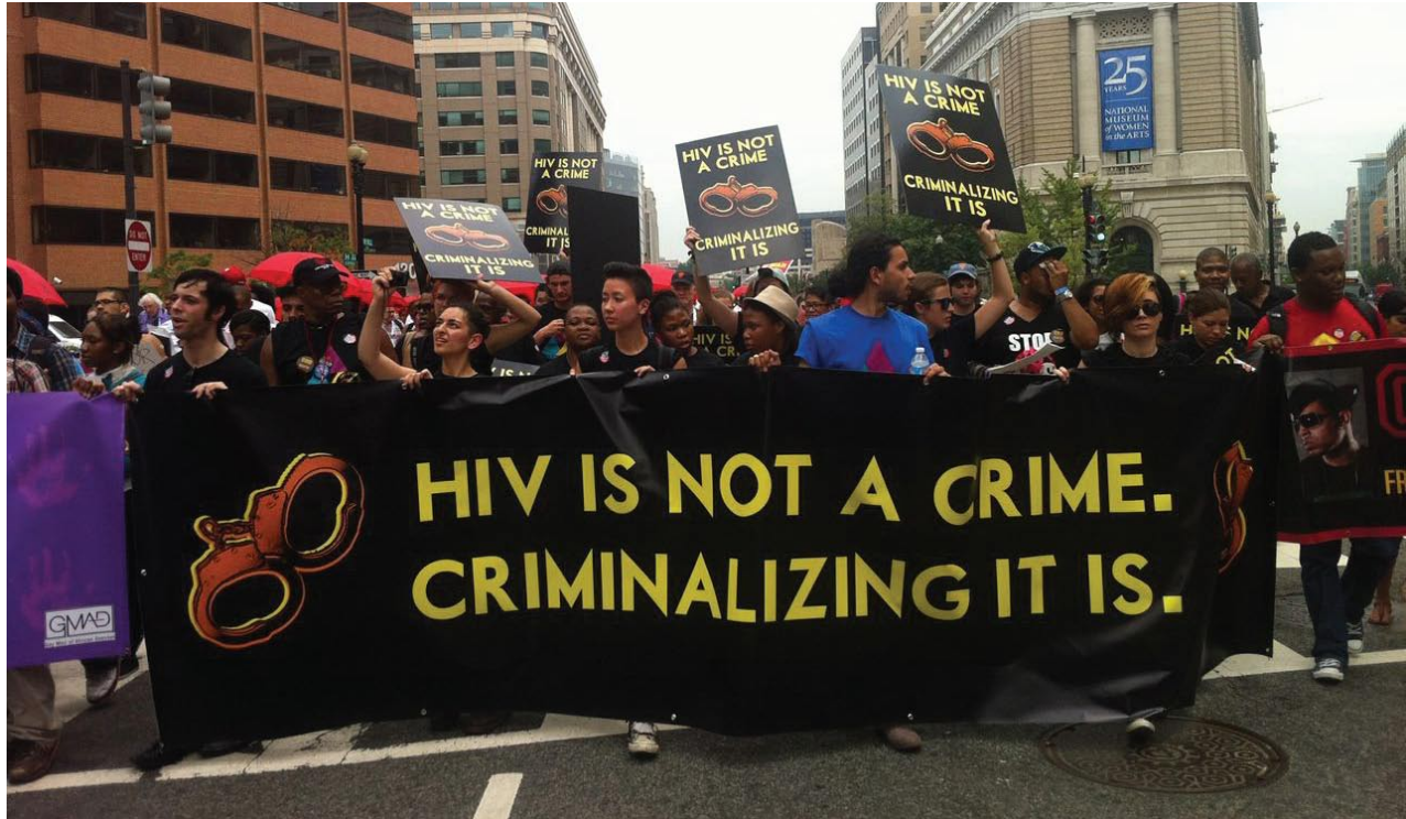
March Against HIV Criminalization, Washington, D.C.