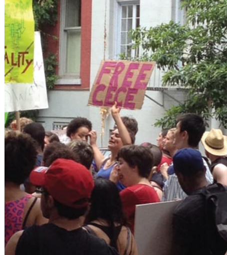
Trans Day of Action, organized annually by the Audre Lorde Project, New York City, June 2012