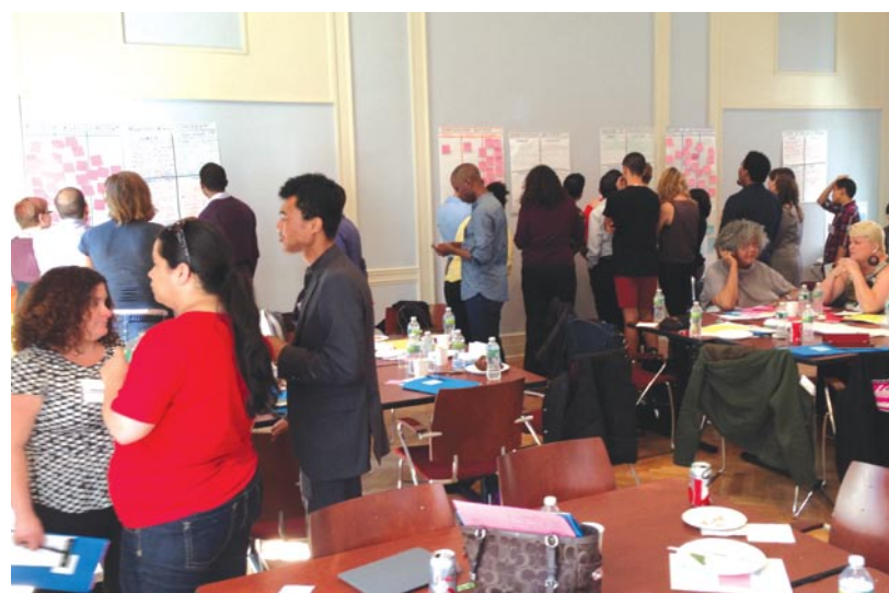
Participants at convening held at Columbia University School of Law May 2013

In May 2013, a working group made up of the authors of the report convened a group of over 50 activists, policy advocates, lawyers, and grassroots organizations working on LGBT, criminalization, and racial justice issues at the local, state, and federal levels for a two-day meeting at Columbia Law School 7 to discuss and articulate a legislative and policy agenda for action on behalf of the communities we serve—namely LGBT people and PLWH who have come in contact with the criminal justice system.