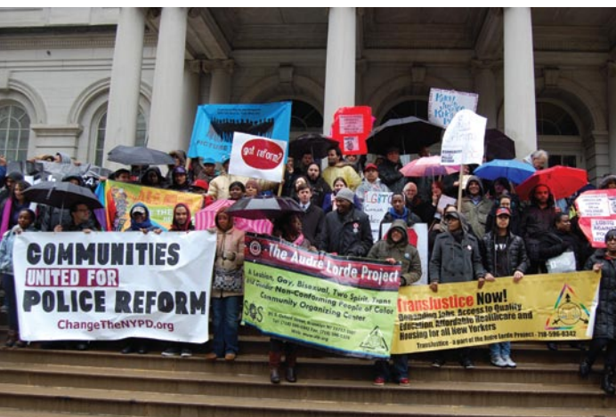
LGBT community organizations join launch of Communities United for Police Reform, New York City, February 2012

hearing. When the court officer brought her into the holding area he asked her, “are you a man or a woman?” When she responded that she was a woman he grabbed her genitals and said, “women don’t have dicks.” While she was crying he called her names and continued to make comments about her breasts and genitals. All of this was reported to me after the incident as she was allowed to return home because she was already on a GPS unit. There was no one else around watching the court officer. The individual who was assaulted did not want any reports filed or comments made to the court because she was fearful that it would result in her getting in more trouble, possibly getting locked up in jail again, or having another incident of being alone with another court officer.