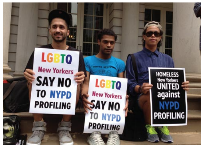
LGBTQ youth leaders from Streetwise and Safe (SAS) advocate for an enforceable ban on police profiling in New York City, July 2013

Stop and frisk affects women of color such as myself. It affects LGBT youth of color such as myself. I have been stopped numerous times by police in the West Village and Chelsea neighborhoods. For instance, I was stopped and frisked three years ago when I was leaving Chi Chiz, a primarily African American LGBT club in the West Village at around 2 AM with a group of four friends who were transgender women and gay men. As we left the club, we were immediately stopped by police who told us to put our hands on the wall. They told us it was a “routine search.” There was no reason to believe we were committing any crime. We did what they told us to. I was facing the wall, they pat my arms down, ran their hands between my chest, patted my pockets and then went inside my pockets and pulled my wallet out, checked my ID, made sure none of us had any warrants, and then told us we were free to go, but we better not be around when they came around again. After they walked away, I felt violated. I felt like they took something from me. I felt demoralized. I felt like I wasn’t safe, I was afraid that they would lock me up just for being outside.