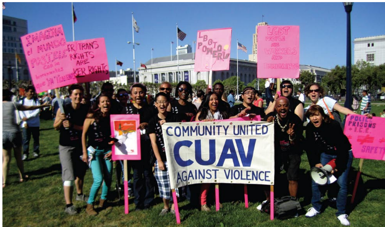
Community United Against Violence (CUAV) members, staff and board at May Day march

Early drafts of the full report were circulated to the attendees of the meeting, other experts in the field, and incarcerated individuals, for additional feedback to ensure that the issues raised and policies proposed accurately reflected their needs and priorities. 8 The authors would like to thank all of those who collaborated with us and contributed to the process, and honor all of the individuals who, like CeCe McDonald and countless others whose names we will never know, have resisted and survived the criminalization of LGBT people and PLWH across time and space.