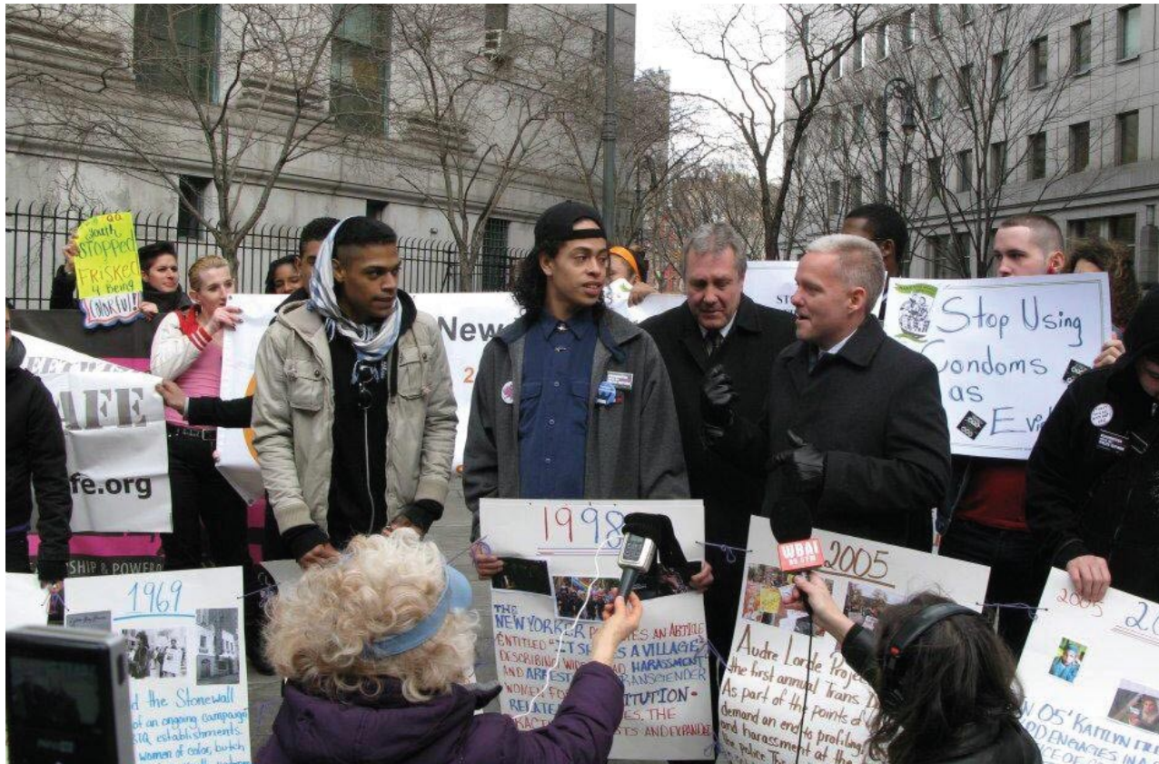
LGBTQ demonstration in support of litigation challenging NYPD stop and frisk practices in New York City, March 2013

Six key topic areas organize the discussion: