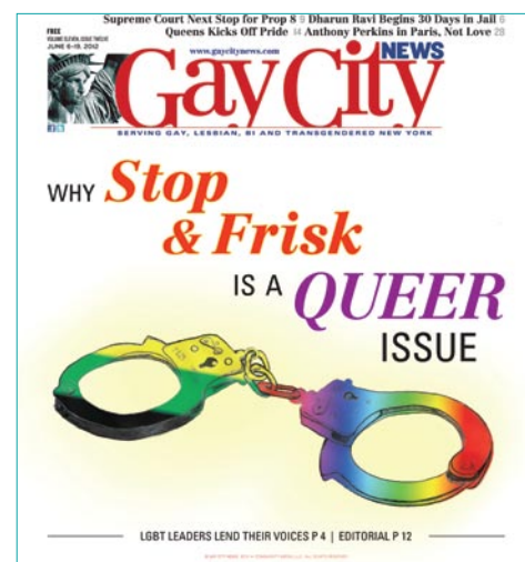
Cover of Gay City News, New York City, June 2012

President Obama’s 2013 State of the Union address made history by recognizing LGBTQ and Two Spirit communities’ resistance to discriminatory policing during the Stonewall Uprising as a critical moment in the march toward equality. Today, the discriminatory policing and abuse of LGBTQ and Two Spirit people which features prominently in the origin story of the modern LGBTQ rights movement is widely perceived to be relegated to the now distant past by more recent legal, legislative, and policy victories.