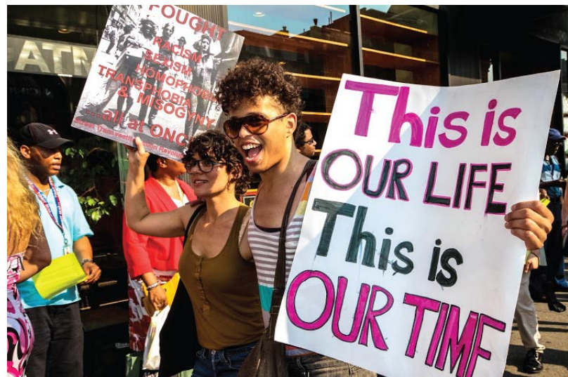
Trans Day of Action, organized annually by the Audre Lorde Project, New York City, June 2013 IMAGE: S. NARASIMHAN

Specifically, the roadmap is intended to: 1) guide federal engagement with federal, state, and local law enforcement agencies, jails, and prisons; 2) inform the implementation of the Prison Rape Elimination Act (PREA); 3) advocate for additional reforms beyond PREA; 4) generate momentum around the LGBT policy priorities that members of this working group have presented to the current Administration over the last four years; 5) highlight and address drivers of criminalization of LGBT people and PLWH; and 6) provide analysis that will serve as a resource for policy makers and advocates alike.