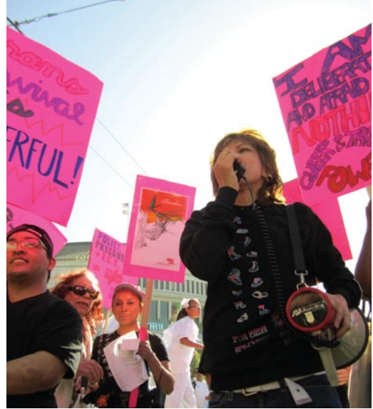
Community United Against Violence (CUAV) member at a march against S-Comm deportation policy, San Francisco, 2013.