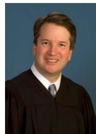
Judge Brett Kavanaugh