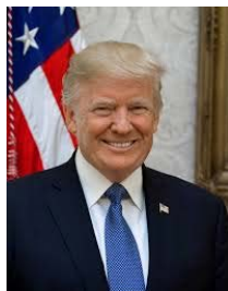
President Donald Trump