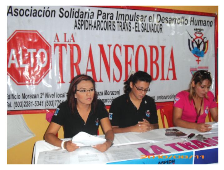
ASPIDH members at a booth advocating for trans healthcare rights.

assists young trans people in the proper and healthy use of feminizing hormones.<sup>30</sup> The Asociación Solidaria Para Impulsar El Desarrollo Humano (ASPIDH) has implemented comprehensive HIV prevention and health promotion activities for trans women in El Salvador.<sup>30</sup> In Nicaragua, nine organizations joined forces to develop a Strategic Plan of Comprehensive Care for the Transgender Population, which calls for advocacy for legal reform, training workshops, health literacy programs, and behavior change interventions.<sup>20</sup>