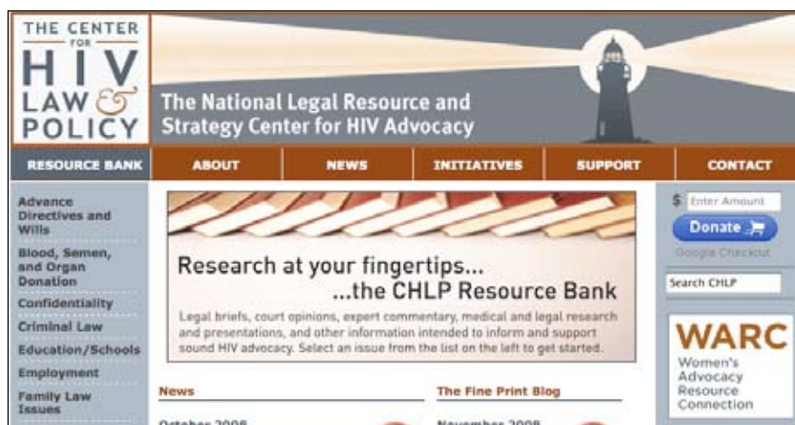
The improved CHLP website highlights the Resource Bank, special initiatives and news.

The Resource Bank also now has its first Spanish-language resources and accompanying abstracts, a first step in making the Resource Bank a multi-lingual source of information. Still in the works but coming soon are